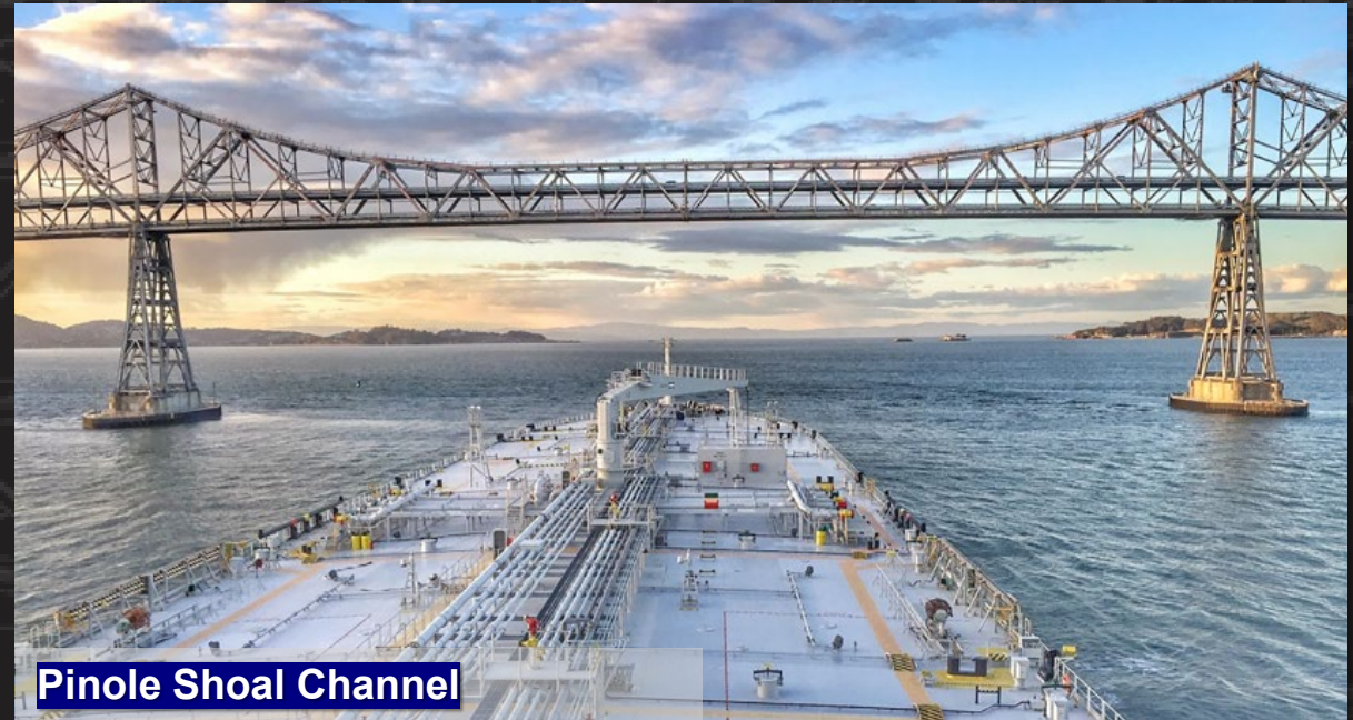
Pinole Shoal Channel