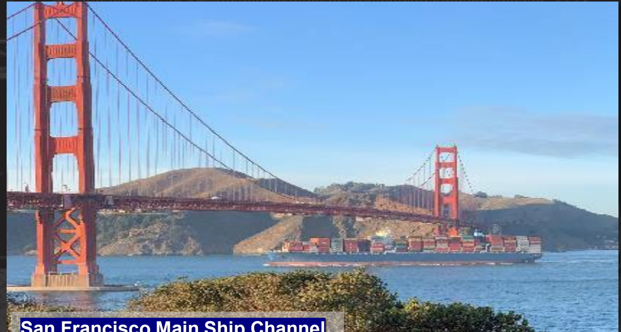
San Francisco Main Ship Channel