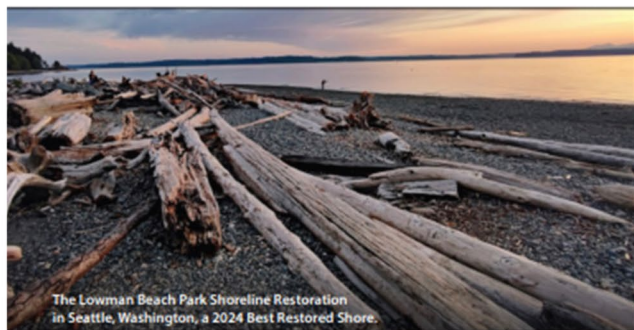
The Lowman Beach Park Shoreline Restoration in Seattle, Washington, a 2024 Best Restored Shore.