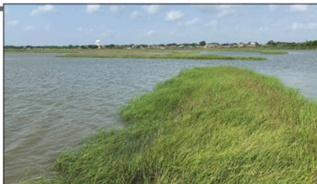
Above: The Dollar Bay Marsh Restoration in Texas City, Texas, a 2024 Best Restored Shore. Below: The Illinois Beach State Park Shoreline Stabilization in Zion, Illinois, a 2024 Best Restored Beach.

ASBPA will promote the timely and effective allocation and implementation of BIL, IIJA, and IRA funds for coastal projects.